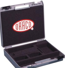
Transport box 42861